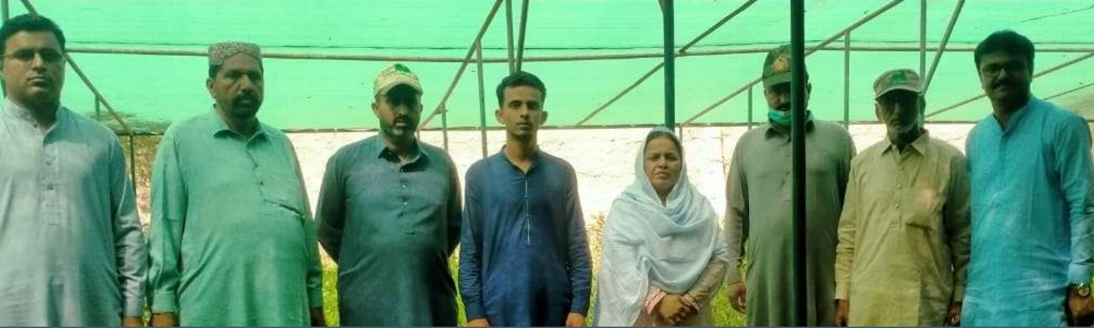
SUKKUR & SBA/MARCH 25 AND 26, 2021

SINDH RURAL SUPPORT ORGANIZATION (SRSO) HAS BEEN INITIATED THE DISTRIBUTION OF FRUIT TREES AND CONDUCTED COMMUNITY WORKSHOPS AMONG THE RIVERINE COMMUNITIES IN DISTRICT SUKKUR AND SBA UNDER SUSTAINABLE FOREST MANAGEMENT (SFM), UNDP-GEF PROJECT, IMPLEMENTING BY MINISTRY OF CLIMATE CHANGE GOVERNMENT OF PAKISTAN THROUGH SINDH FOREST DEPARTMENT.