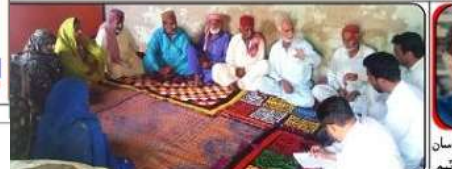
A group of people playing a board game, likely a social activity organized by SRSO.